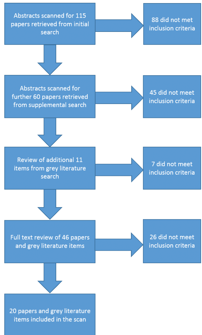
Figure 1. Academic and grey literature search findings

Despite some indications that early warning systems can contribute to earlier identification of deterioration (Carle, Alexander, Columb, & Johal, 2013; Shields, Wiesner, Klein, Pelletreau, & Hedriana, 2016), the majority of available studies have attempted to validate the use of maternity early warning tools, scores and triggers only in specific populations of women (Edwards et al.,